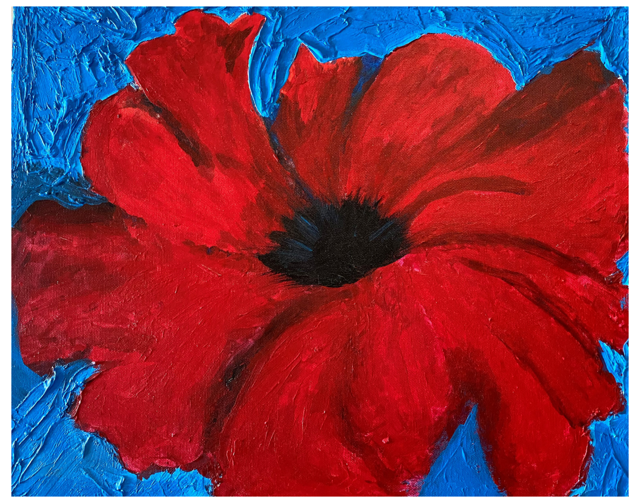
Poppies by Studio Painters, instructed by Andréa Fabricius